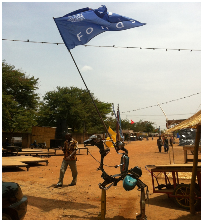
Work by local artist in Bougsemtenga, Ouagadougou

The meeting in Ouagadougou included a speed date event and a mini-festival 'Raconte-moi en famille', so that the network partners could become acquainted with the city's cultural organisations and presented themselves through artistic performances. During the meeting, the network partners also acted for the first time as advisors in the project application procedure. The meeting also drew up a list of future themes for the targeted calls for proposals and issued advice for potential network partners in 2013.