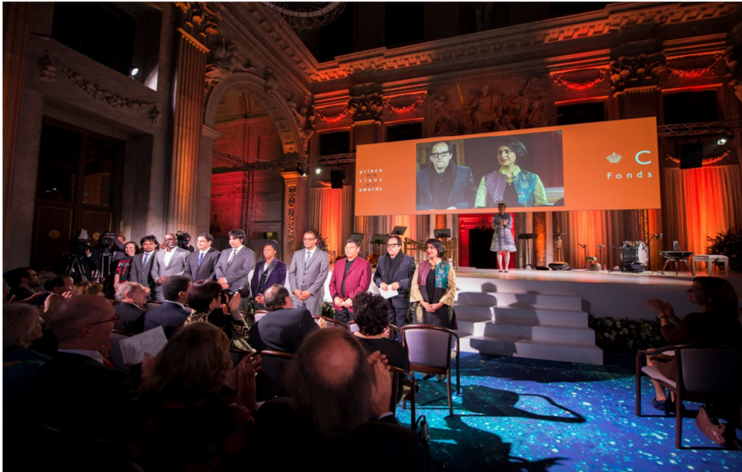
The ten Prince Claus Awards laureates at the Awards Ceremony in Royal Palace, Amsterdam

The ceremony in the Royal Palace in Amsterdam opened and closed with the presentation of the musical composition 3 Thousand Rivers: Prelude by Victor Gama and included a Taller Flora Fashion Show by Prince Claus laureate Carla Fernández.