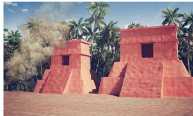
Fig. 17. South Group Pyramids 10L1 and 10L2 ideal reconstruction. (Drawing Z. Herguido)

La Blanca is an ancient Mayan city located in the Department of Petén, Guatemala. One of the largest Mesoamerican Late Classic sites. This project successfully implemented the architectural design and rebuilding of roofs that protected several of the most important structures at the site. A severe storm in October 2012 destroyed the thatched roofs that protected the West and South side of the Palace in the Acropolis and the top temple in the South structures. The damage caused a major threat to the structures and their interiors. The conservation project included research on the preservation of the surrounding natural landscape for the future. A center built through the project informs visitors, and provides tour guide training and educational workshops for the preservation of the site. The Prince Claus Fund supported the project with € 35.000.