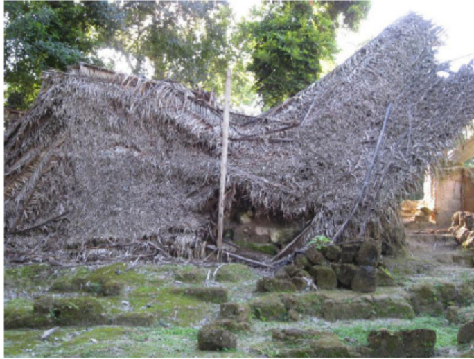
Fig. 15. Palace 6J2 South side thatched roof after destruction.