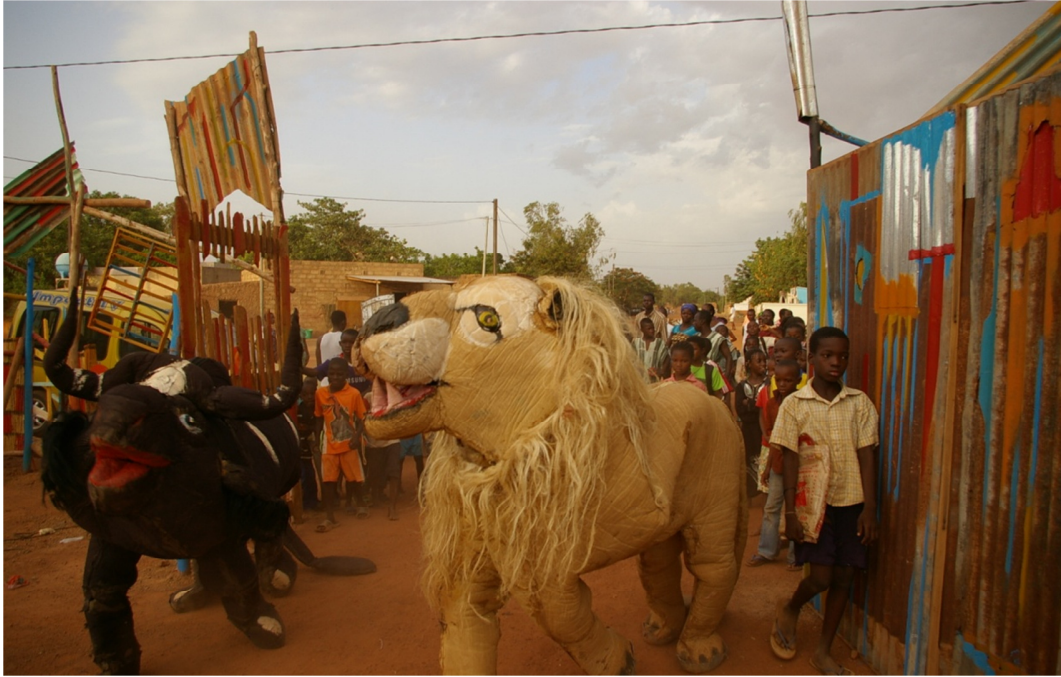
Celebrations during neighborhood festival 'Raconte-moi en famille', Bougsemtenga, Ouagadougou