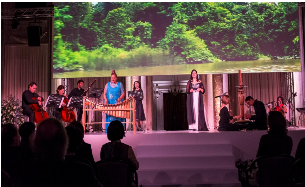
Presentation of 3 Thousand Rivers: Prelude by Victor Gama

The ceremony in the Royal Palace in Amsterdam opened and closed with the presentation of the musical composition 3 Thousand Rivers: Prelude by Victor Gama and included a Taller Flora Fashion Show by Prince Claus laureate Carla Fernández.