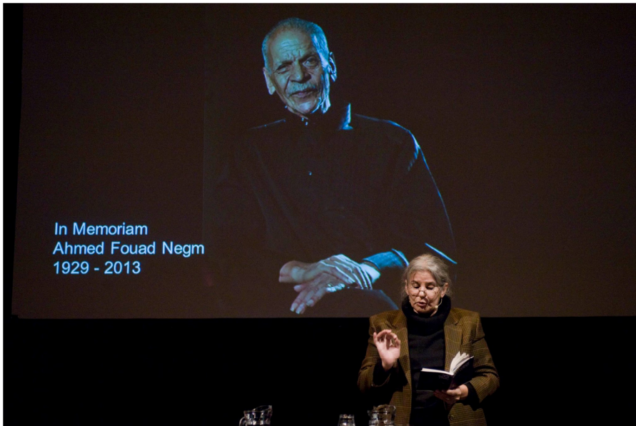
Culture in Action: A tribute to 2013 Principal Prince Claus Laureate Ahmed Fouad Negm (Egypt), De Balie, Amsterdam, 12 December 2013