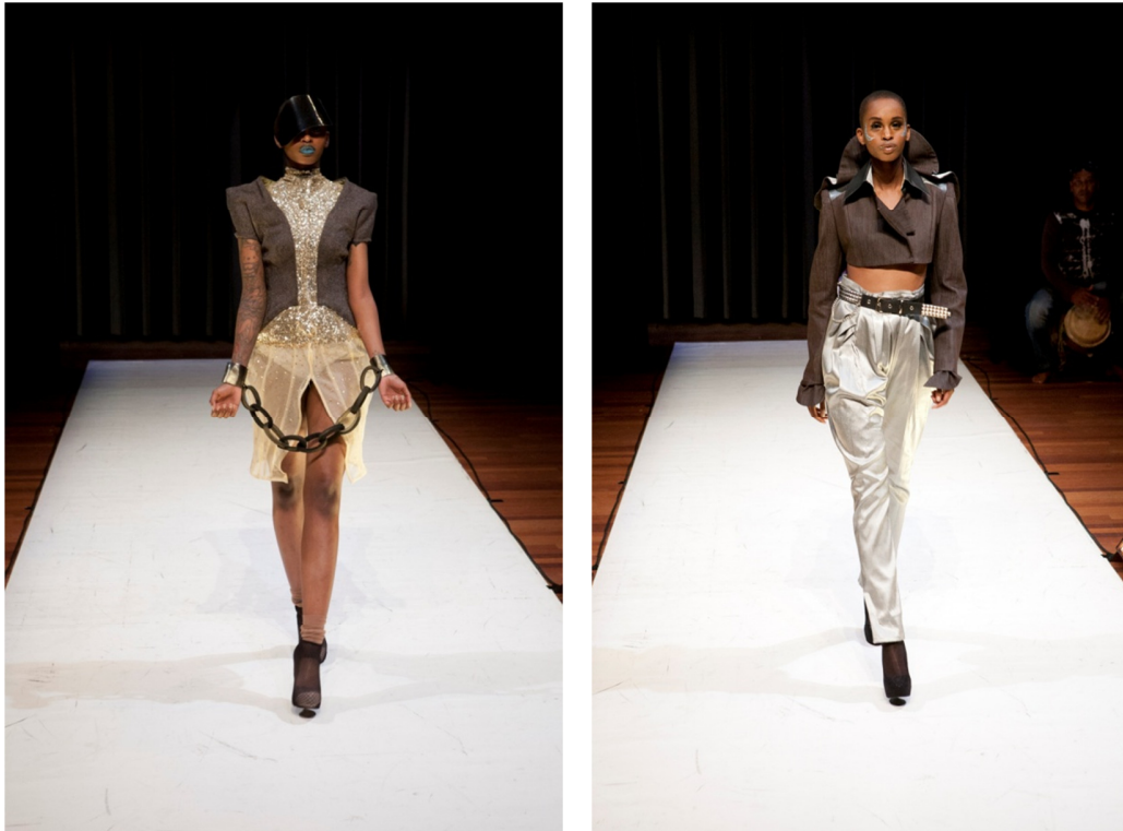
Fashion Show Facing Up to the Past, Bijlmer Parktheater, Amsterdam 11 July 2013

On 11 th July in Amsterdam's Bijlmer Park Theatre, the Prince Claus Fund and Music And Fashion Battle (MAFB) will host 'Facing Up to the Past', an evening of fashion and lectures commemorating the 150th anniversary of the abolition of slavery. Three Dutch fashion designers of African, South American and Caribbean descent presented collections that reflected on the history of slavery. Lectures by leading international scholars took place prior to each fashion show.