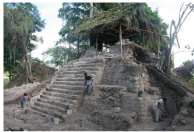
Fig. 16. South Group Pyramid 10L2 during excavation.