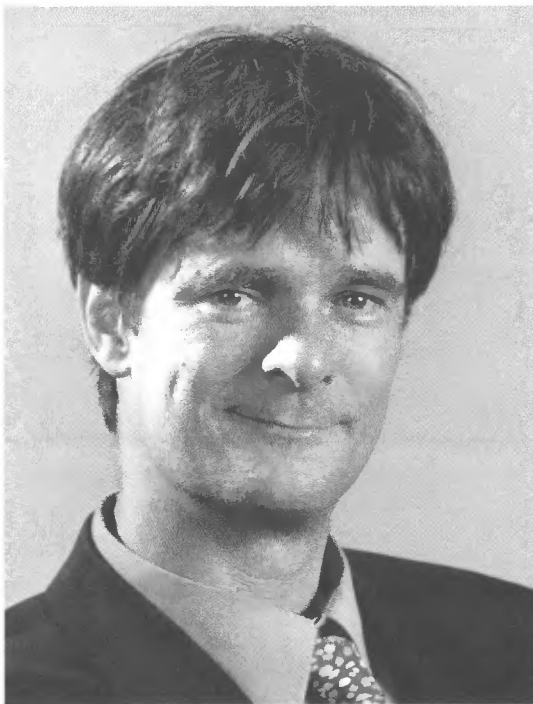
13 • Dr. F. van der Ploeg, the Dutch Secretary of State for Culture.

For this reason, I thought it was important to be here today, because I do support the idea of an association that is intended to bring together all organisations from European countries that are involved in managing the archaeological heritage. We are all confronted with similar problems, and the organisations can learn from each other, exchange experiences, and work together at the European level. This is absolutely necessary when we want to provide a real future for the European past - not only because of the process of unification, which is primarily motivated by politics and, of course, economics. Archaeology itself is in fact also European and, when you think about it, it doesn't really make any sense to talk about the archaeological past of the Netherlands, or of any other country. The concept of the nation state is a comparatively recent invention and I would rather prefer to see the present-day nations as stewards of a territorial portion of a larger and common, European heritage.