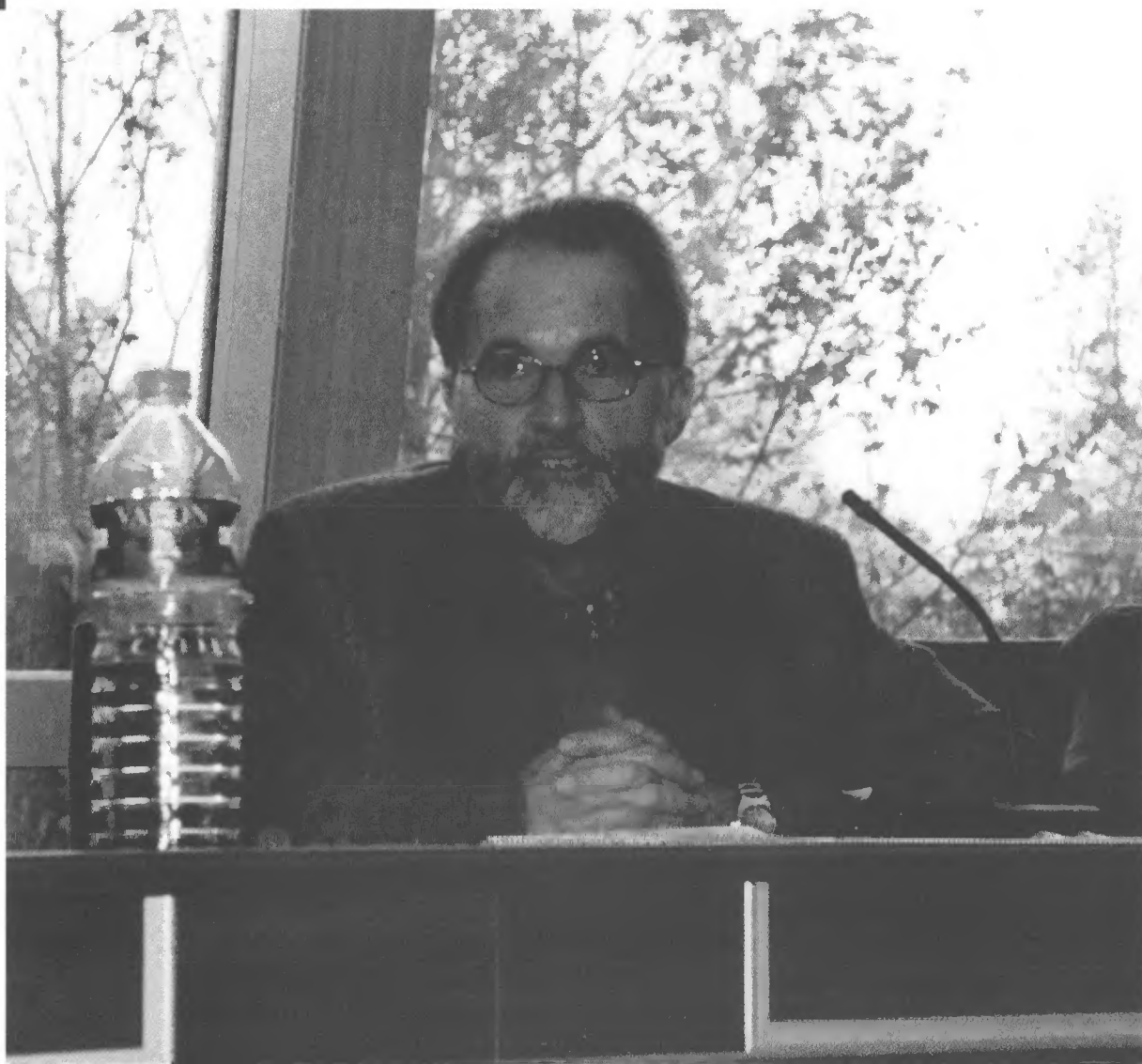
10 • Director General Raymond Weber of the Council of Europe welcomes the Consilium.